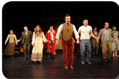
Cast of ASSASSINS